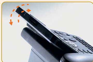
Fully adjustable display for a clear and comfortable viewing angle, from wherever you're looking.